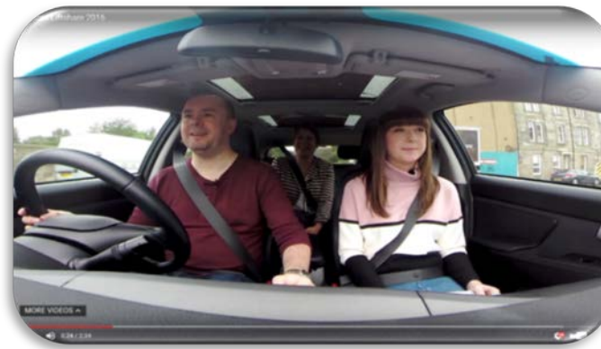
Figure 1:SEStran Liftshare Lip Sync