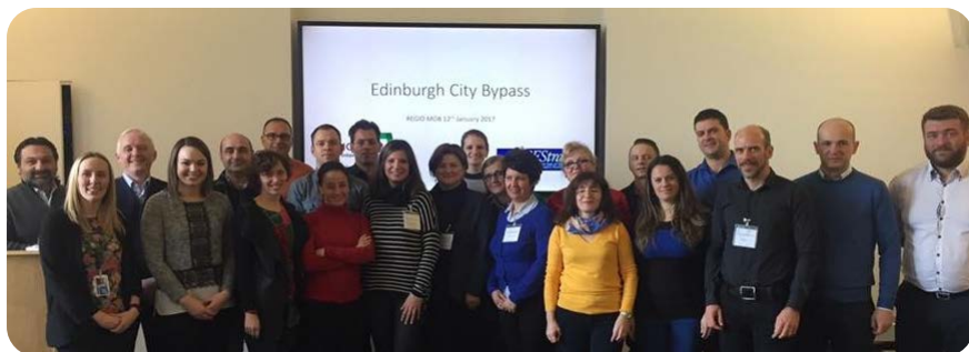
Figure 2: REGIO MOB Workshop held in January

The REGIO MOB project involves seven European partners with the main objective to ensure sustainable growth in Europe by promoting sustainable mobility and improving the relevant policy documents.