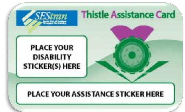
Figure 3: SEStran's Thistle Card

Taking the Thistle Card forward, in late 2016, the Thistle Card app was released for both Android (Google Play Store) and Apple (App Store). In partnership with other RTPs, SEStran will be looking at future opportunities to develop the app further. This may include 'push notifications' and links to the aforementioned Bustracker SEStran.