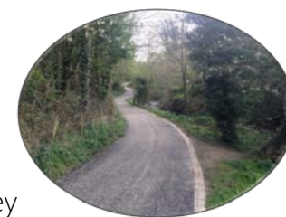
Figure 4: Daiches Braes

The grant is administered on a match funded basis to local authorities and organisations to fund a variety of projects including feasibility studies and design work. In 2015, SEStran published the Strategic Cross Boundary Cycle Development study which identified strategic 'missing links' and improvements to the cycle network in the region. Daiches Braes, part of the Brunstane Burn path and a key commuter link between East Lothian and Edinburgh, was identified as a cross-boundary scheme which required improvement. A highlight of the 2016/17 grant was awarding Edinburgh & the Lothians Greenspace Trust a grant, with SEStran providing match-funding with Sustrans Scotland, under the Regional Cycle Network Grant Scheme, to upgrade the surface at Daiches Braes.